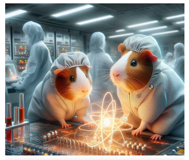
Generated with AI on June 26, 2024 at 5:50am Prompt: guinea pigs studying subatomic particles in a cleanroom, photorealistic